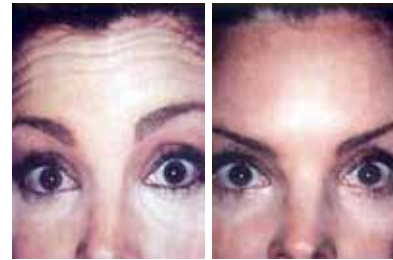
Before and After Botox