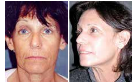
Before and After CO2 Laser Resurfacing